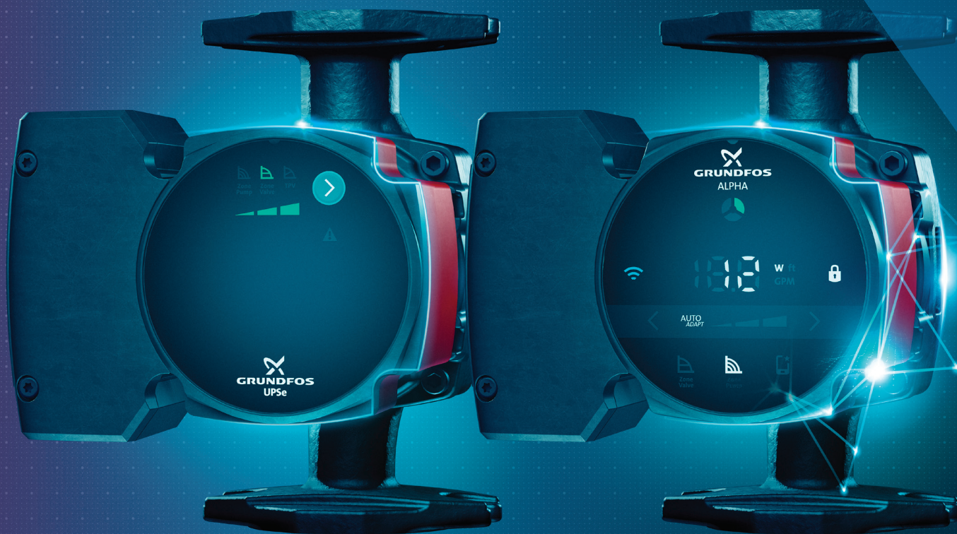
THE NEW UPSe